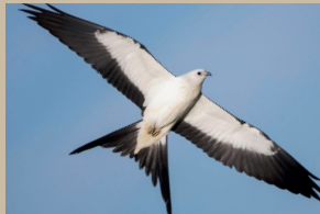
Swallow-tailed Kite* Elanoides forficatus