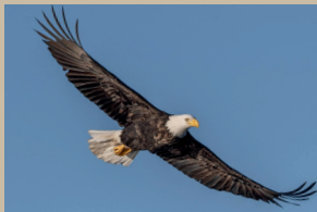
Bald Eagle Haliaeetus leucocephalus