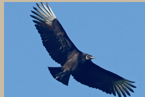
Black Vulture Coragyps atratus