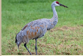
Sandhill Crane Antigone canadensis

Large Walking Birds - These species can fly but spend most of their time foraging on foot.