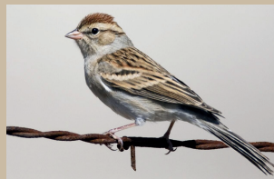
Chipping Sparrow (w)*