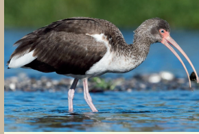
Juvenile White Ibis Eudocimus albus