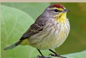
Palm Warbler* (w) Setophaga palmarum