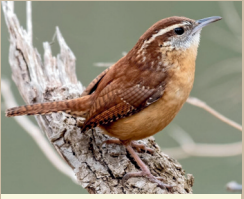
Carolina Wren Thryothorus ludovicianus

In and Around Bushes, Shrubs, and Hedges - Look in brushy vegetation as it provides nesting sites, food, and cover for many birds. Try saying “Pish-Pish-Pish” and some birds may peek their head out!