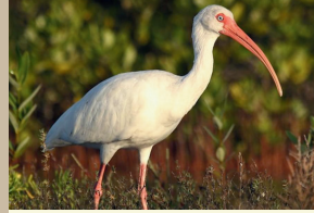
White Ibis Eudocimus albus