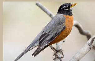
American Robin (w)*