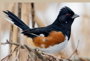
Eastern Towhee Pipilo erythrophthalmus

*Look for tail bobbing, a common behavior of this species.