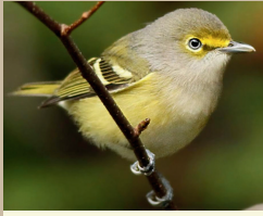
White-eyed Vireo Vireo griseus