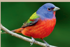
Painted Bunting Passerina ciris