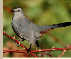
Gray Catbird (w) Dumetella carolinensis