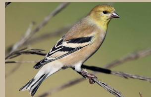
American Goldfinch (w)