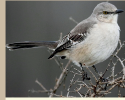
Northern Mockingbird Mimus polyglottos

Large Walking Birds - These species can fly but spend most of their time foraging on foot.