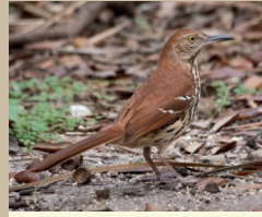
Brown Thrasher Toxostoma rufum