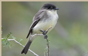
Eastern Phoebe (w)