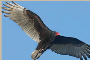
Turkey Vulture Cathartes aura