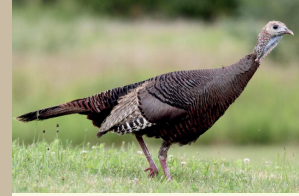
Wild Turkey Meleagris gallopavo

Flying Overhead - Listen for crow caws or the sharp cries of ospreys, herons, hawks, or eagles. These common flyover species have distinctive body shapes.