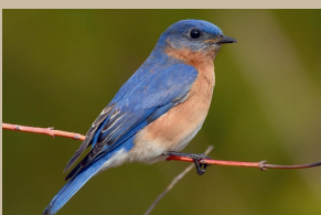
Eastern Bluebird Sialia sialis

Weedy Fields, Edges, and Scrubby Areas - These birds may be hidden in tall grass or thickets and pop up on a stem or branch to look around.