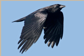
American Crow Corvus brachyrhynchos

Flying Overhead - Listen for crow caws or the sharp cries of ospreys, herons, hawks, or eagles. These common flyover species have distinctive body shapes.