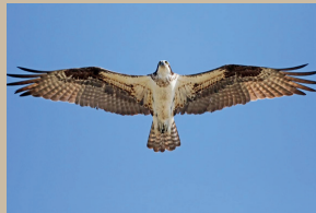
Osprey Pandion haliaetus