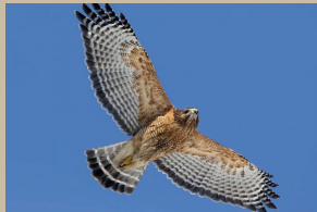
Red-shouldered Hawk Buteo lineatus