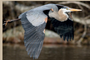
Great Blue Heron Ardea herodias