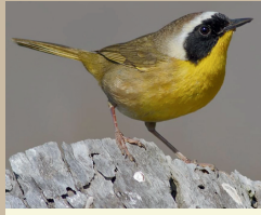
Common Yellowthroat Geothlypis trichas