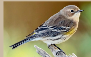
Yellow-rumped Warbler (w)*