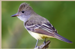
Great Crested Flycatcher (s)