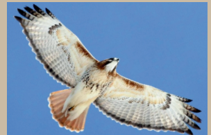
Red-tailed Hawk Buteo jamaicensis