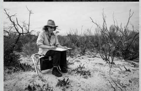
Conservation fieldwork