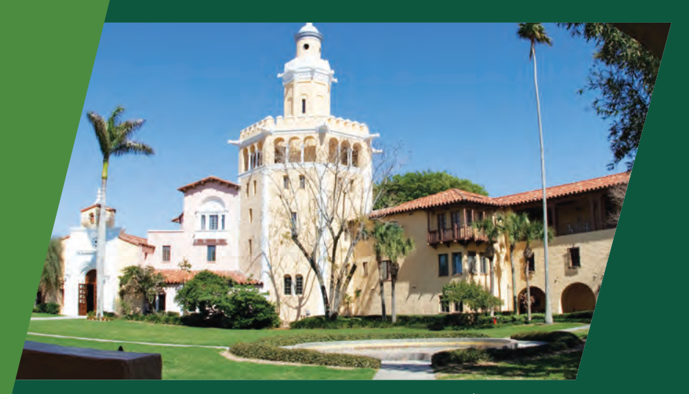
Stetson University College of Law | Gulfport, Florida