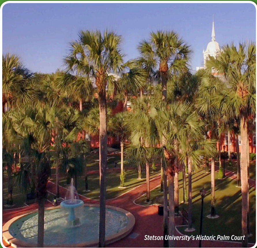
Stetson University's Historic Palm Court