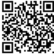
Remind 101 - All Ensembles