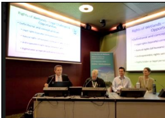
Rights of Wetlands side event