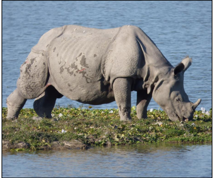
A grazing rhinoceros at Kaziranga National Park in Assam, India