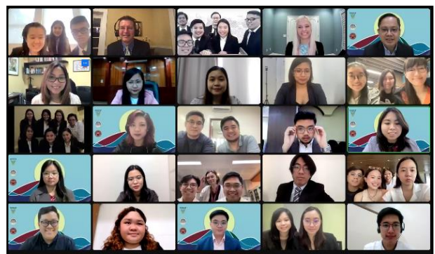
Clockwise from top left: EARR at Soongsil University; Indian National Rounds; SEARR hosted by the University of the Philippines; Finals of Colombian National Rounds at Javeriana University