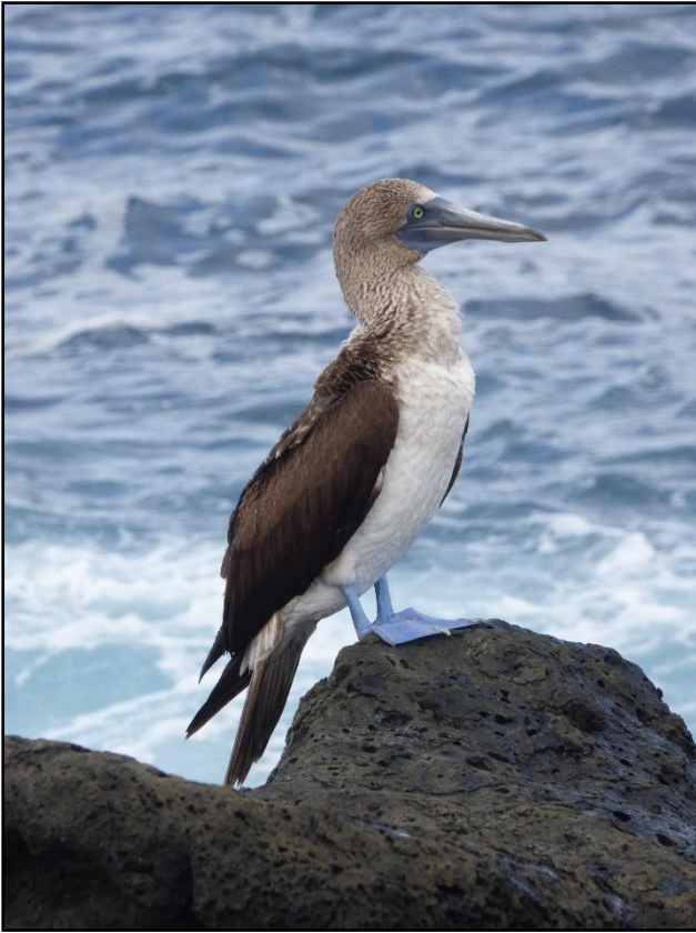
A blue-footed booby in the Galapagos