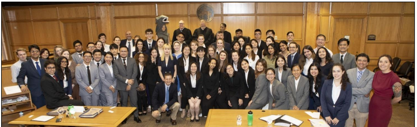
Traditional group shot at the International Finals of the Stetson IEMCC, with royal frilled shark lurking the background.