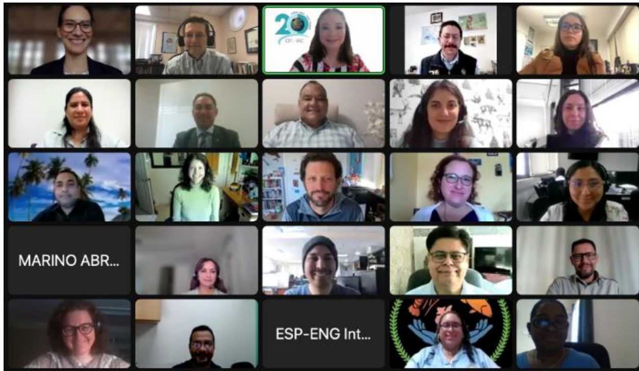
A meeting of sea turtle experts

At the request of the IAC Secretariat, the Biodiversity Institute began work on a report analyzing the implementation of treaty obligations. Five Stetson students were selected for the project and attended the initial presentation of the draft report to the Meeting of the Consultative Committee of Experts in April 2023. After the presentation, the Committee recommended a final report be prepared and presented by Stetson at the IAC Conference of the Parties to be held in Ecuador in 2024.