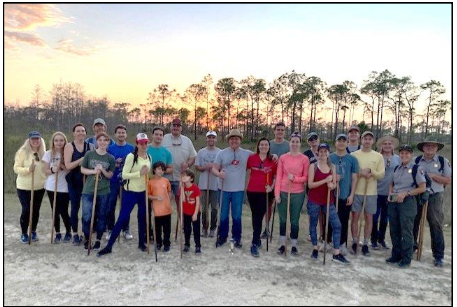
A typical legal research and writing outing at Stetson Law