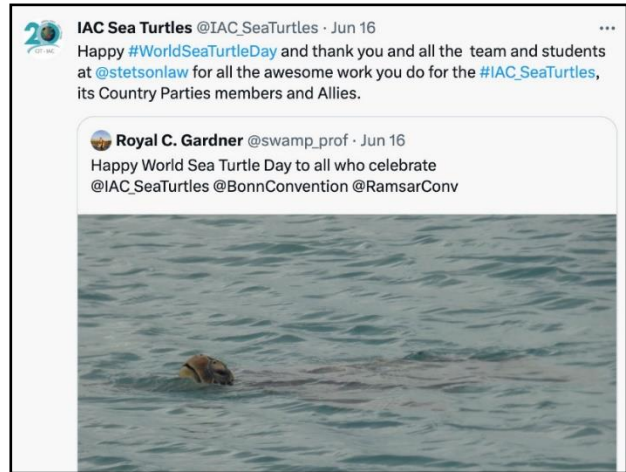
A sea turtle Tweet

At the request of the IAC Secretariat, the Biodiversity Institute began work on a report analyzing the implementation of treaty obligations. Five Stetson students were selected for the project and attended the initial presentation of the draft report to the Meeting of the Consultative Committee of Experts in April 2023. After the presentation, the Committee recommended a final report be prepared and presented by Stetson at the IAC Conference of the Parties to be held in Ecuador in 2024.