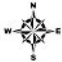
Kaart Begrenzing gebied Spaans Lagoen