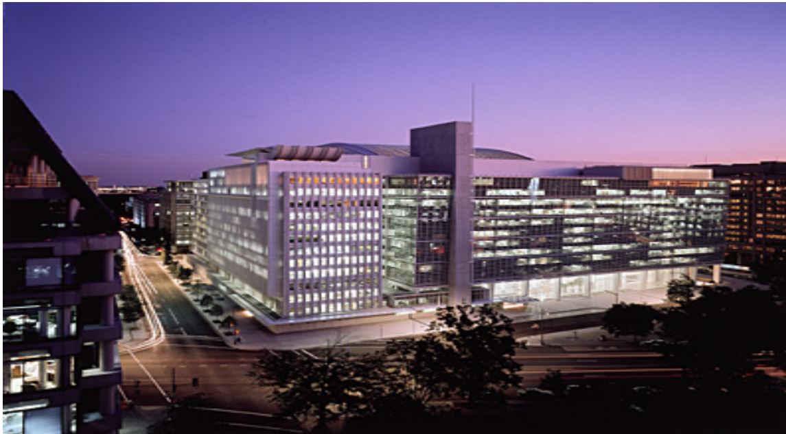
The World Bank, Washington, DC

Consequences of global economic interactions -- overseas development assistance