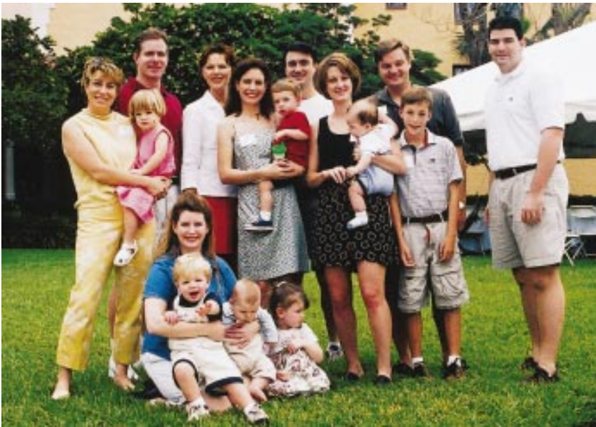
Class of 1991 members and their families.