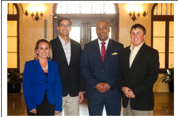
Stetson students who created winning YouTube Video.

One of the goals of the Institute is to get students more interested in the issues of legal communication. The Florida Bar Standing Committee on Professionalism and the Florida Bar's Harry Latimer Center on Professionalism recently instituted a Law Student Professionalism YouTube Contest to draw attention to the issues of professionalism in practice. Four Stetson students wrote, produced, and acted in a wonderful two-and-a-half-minute video that focuses on professionalism in legal communication, and they won the contest. The video, "Practice In Motion," is based on standards described in the Florida Bar's recently approved "Professionalism Expectations," which take the