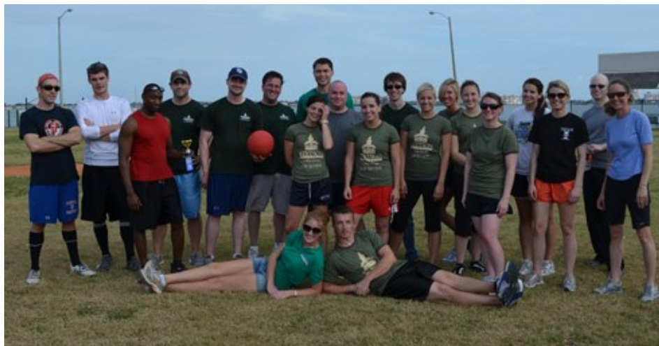
Stetson Law: First and Second Place Teams in one photo