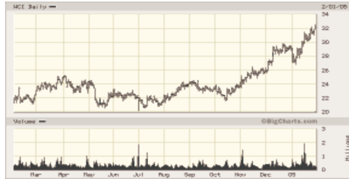
WCI Communities, Inc. Chart (2/1/2005)