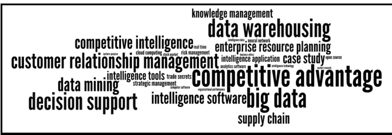
Figure 3. Tagcloud Visualization of Major Topics in the BI&A Literature

intelligence, enterprise resource planning, and knowledge management were also highly ranked. Overall, the topics extracted were highly relevant to BI&A, especially for its managerial and application values, although most of the detailed technical terms, as described in the previous research framework sections, were not present. This could be attributed to the tendency of authors to use broad terminologies in article titles and abstracts.