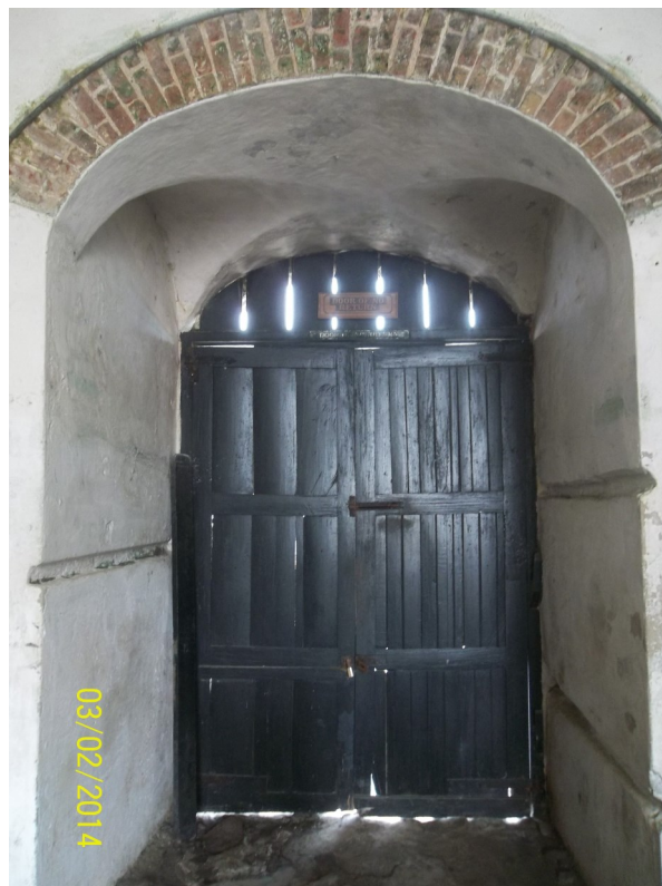
Right: A reminder of the importance of studying history in Ghana