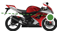
FRONT OF MOTORCYCLE