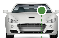
FRONT OF CONVERTIBLE/REMOVABLE TOP VEHICLE

Permits are required to be displayed on either the driver's side of the rear window in the lower left-hand corner. For convertible/removable top vehicles, the permit must be affixed to the front windshield on the driver's side in the lower right-hand corner. Motorcycle and moped permits must be displayed in a visible manner, on the front fork of the motorcycle or moped. All permits must be clearly visible and properly affixed using the adhesive provided. Affixing the permit in any other manner than prescribed above will result in a citation for non-compliance. Permits are nontransferable to other vehicles and they must be displayed only on the vehicle to which they are registered.