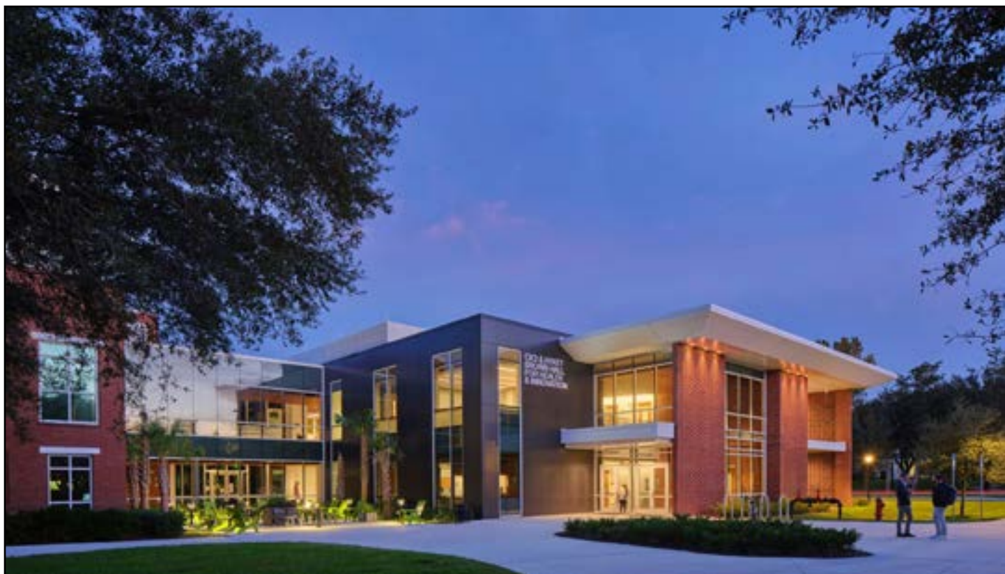
The Cici & Hyatt Brown Hall for Health & Innovation