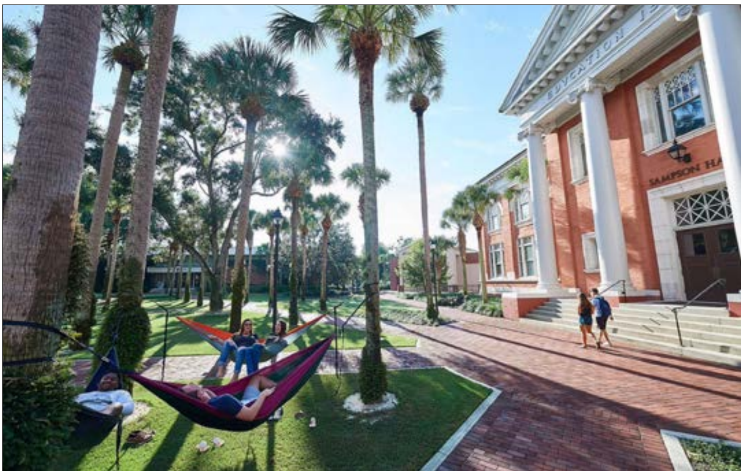
Palm Court and Sampson Hall

The DeLand, Florida, campus houses the College of Arts and Sciences, School of Music and the School of Business Administration. The College of Law is located in Gulfport, Florida, with a satellite campus in Tampa.