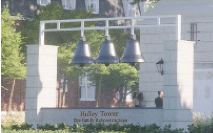
Historical Memorial | $2,000,000 Name on official, significant Hulley Tower Signage

Originally constructed in 1934, Hulley Tower is now a shell of its former self after being battered by multiple hurricanes in 2004 and taken down to its base a year later. In 2023, we launched an historic reconstruction effort to restore Hulley Tower to its former 116-foot height with a new 52-bell carillon at the top to ring out across campus. The former Eloise chimes will be incorporated into the reconstruction in other ways, paying homage to Hulley Tower’s place in our history.