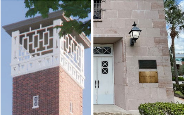
Belfry | $1,000,000 Large individual donor plaque