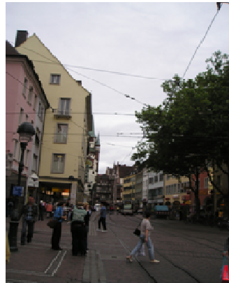
Kaiser Josef Straße Freiburg, Germany