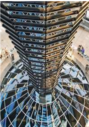
Kuppel, Reichstag, Berlin