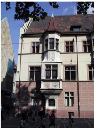
Baseler Bahnhof Freiburg, Germany