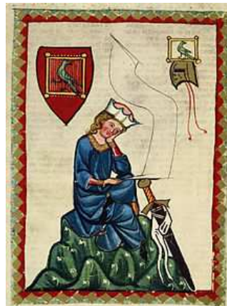
Walter von der Vogelweide