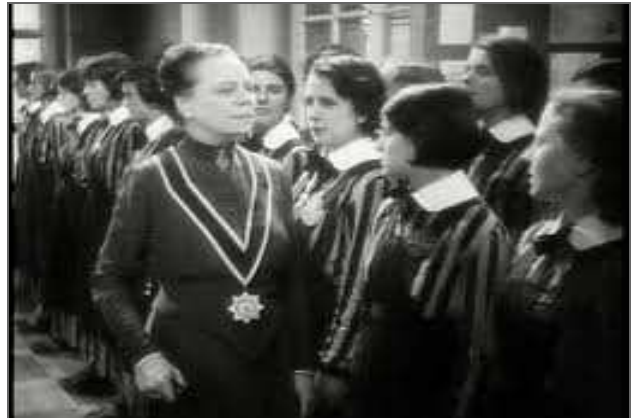
Mädchen in Uniform

Five Units at the GERM 202 level and above.